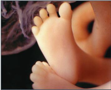
Photo of baby's feet in the uterus at 11 weeks after the LMP (9 weeks after fertilization)