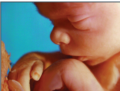
Photo of baby in the uterus at 22 weeks after the LMP (20 weeks after fertilization)