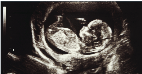
2D ultrasound image of baby at 13 weeks after the LMP (11 weeks after fertilization)