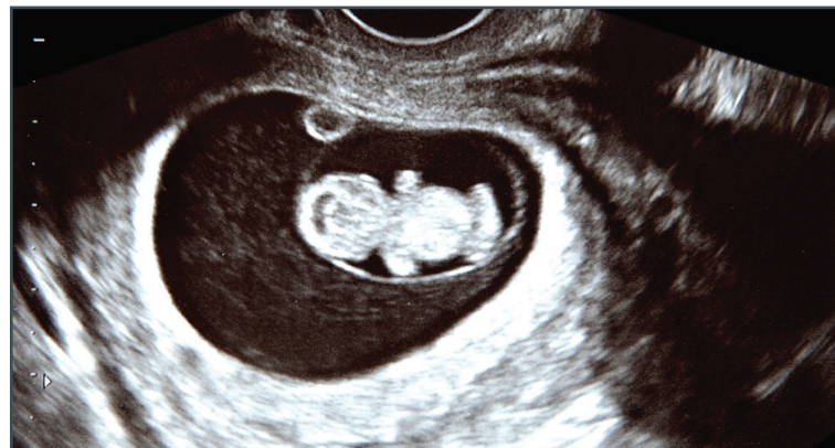
2D ultrasound picture of baby at 9 weeks after LMP (7 weeks after fertilization)