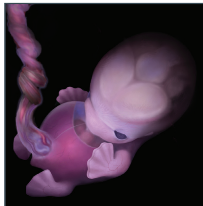
Illustration of baby at 9 weeks after the LMP (7 weeks after fertilization) 12